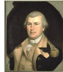
Brigadier General Nathaniel Greene, Prospect Hill Commander