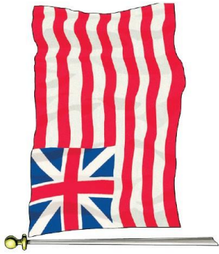
Plate 3b. Illustration of the Grand Union flag featuring the British Union Jack and thirteen red and white stripes symbolizing the union of the American colonies. Considered the “first flag of America,” the Grand Union was first displayed on the Continental Navy’s flagship, Alfred, on 3 December 1775 and was in use until late 1777.