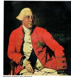
HRM King George III