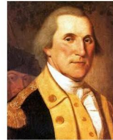
General George Washington, Continental Army Commander