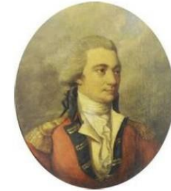
General William Howe, Commander HM Forces, Boston