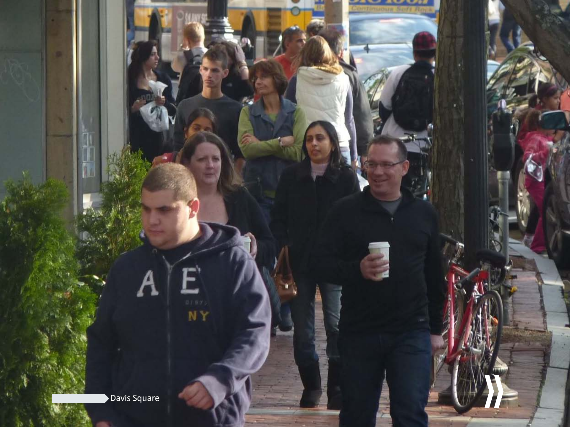
➔ Davis Square