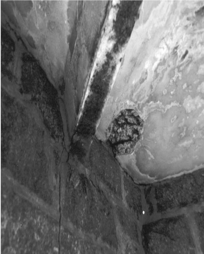
Third Floor, deterioration of concrete and steel support beam