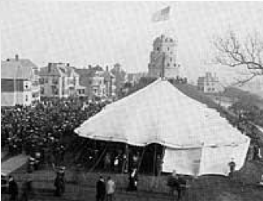
Tower dedication 1903