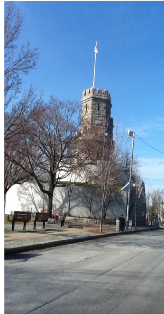
Prospect Hill –2015