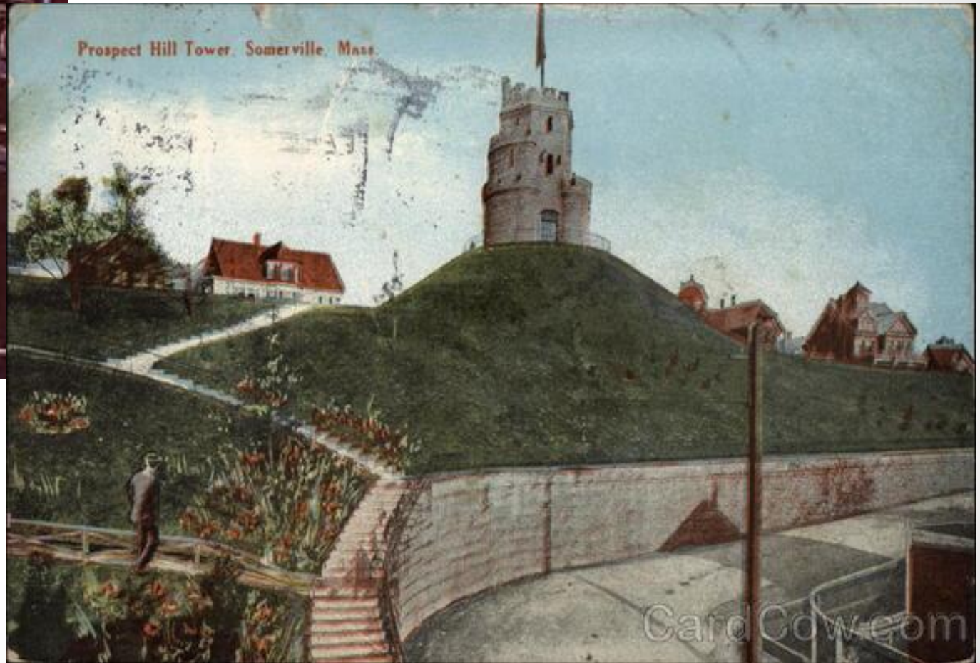
Prospect Hill Tower– Historical Images