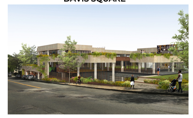
E) Powderhouse Studios Innovation School, 1060 Broadway.

Former Use: Somerville Public Elementary School ,Powderhouse Community School, built 1970s.