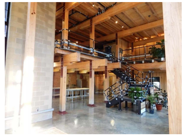
F) Davis Square Lofts, 20-70 Howard Street.

Powderhouse Studios is a small, new high school scheduled to open in 2019. It is designed to optimize students' learning by working on projects of their individual interests outside of traditional, subject-based classes. School days are organized into 3 chunks, from 10am-5pm daily, working with cross-functional teams of mixed ages. It will start with about 40 students ages 13-15 working in small groups with 4 consistent staff members. The plan for the school was developed in collaboration with the Somerville Public Schools, Mass Department of Education and many innovators since 2012. (https://powderhouse.org/)