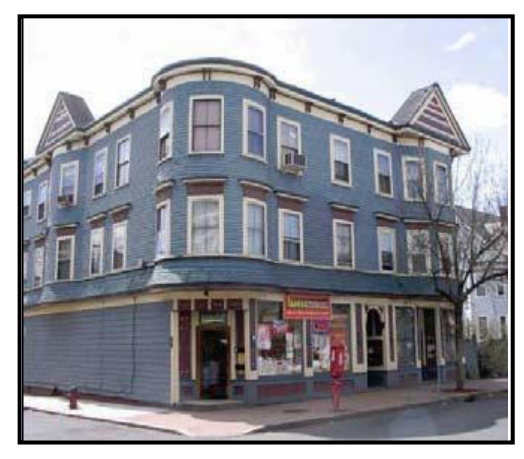
The Bennet Block (early 1890s) at Somerville Avenue & Carlton Street

The lot housing the Bennett Block was originally carved from the old Hawkins estate. The building was initially constructed for William F. Bennett, whose heating and plumbing business was located at what is now 7 Carlton Street. During the early 20th century the upper floors were occupied by Irish and Italian families, employed in the shoe and tube factories, as well as carpenters, clerks and lab workers. Amazingly, the original late Victorian molding that surrounds the display windows remains intact. The upper stories of the Bennett Block retain both the original bowed windows and the polygonal oriel ones. The oriels are unusual in that they are crowned by free-standing pediments, adding considerable interest to the roof line.