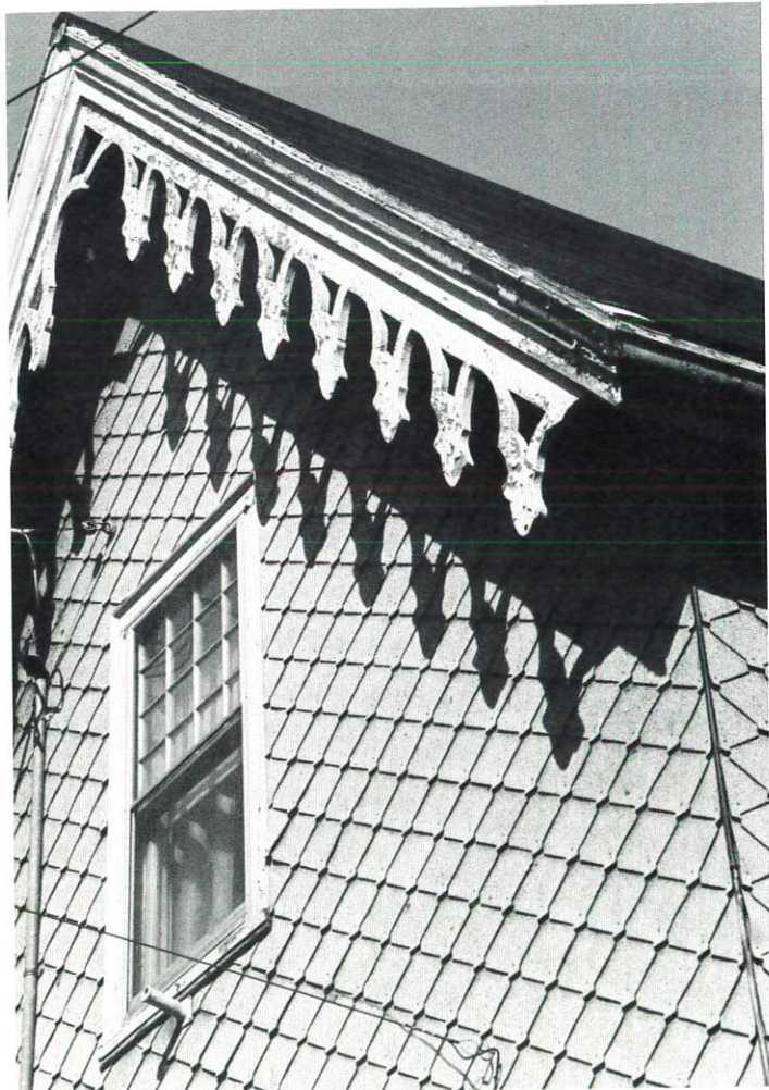
15 Spring Street, ca. 1848.

The following agencies and organizations can be of assistance in obtaining information on the history of a particular property. Some can also provide assistance with building rehabilitation projects.