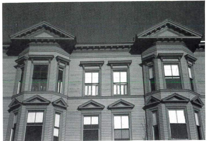
Drouet Block, 1898.

During the eight years since the first publication of this book, Somerville's neighborhoods and commercial districts have experienced many positive changes, including the improvement of several hundred historic buildings. These examples, from all parts of the City, include projects financed by private owners, by private-public partnerships, and projects which used the tax credits available to developers of certain National Register-eligible historic properties. Some projects have been reviewed by the Somerville Historic Preservation Commission. The scale of the projects vary from painting and exterior trim repair to complete revitalization of the structure.