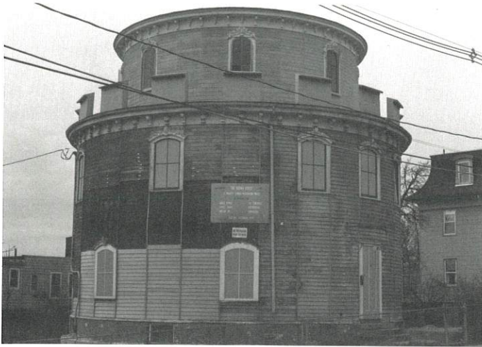
The Round House, 36 Atherton Street, 1859, photograph 1989. Complete exterior restoration is in progress on Somerville's most unique residence. The Preservation Carpentry Program from the North Bennett Street School in Boston has provided skill and labor to remove asphalt siding and to repair or replace the original clapboards. Original ornamental trim has been conserved and will be used as patterns for missing pieces.