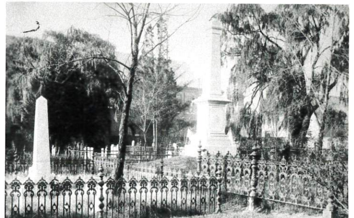
The Milk Row Cemetery, later known as the Somerville Cemetery. Photograph ca. 1875.