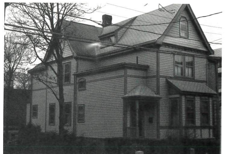
76 Columbus Avenue, photograph 1989. The recent removal of asphalt shingles and a fresh coat of paint have revealed decorative trim and stickwork on the front bay, and a window in the gable peak. A well-conserved carriage house stands in the rear (see page 41).