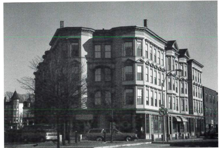
Drouet Block, 56–58 Bow Street and 363–377 Somerville Avenue, 1898. Using the investment tax credit program, this apartment building was restored to its near-original appearance. Vacant and boarded-up storefronts were renovated for a variety of office and retail uses. With its prominent location, the building now provides a focal point for the western edge of Union Square. (Photograph 1989; see page 125 for its appearance before renovation.)

Since 1981, a number of historic properties have been revitalized through the O.H.C.D.'s Storefront Improvement Program, which offers free architectural services and up to a 50% rebate for storefront and sign improvements. Sidewalk improvements, landscape design, and the construction of Union Square Plaza in front of the former fire and police stations have also been completed. A new Public Safety building was created in a former MBTA car-barn, and the Police Station (1932) was redeveloped as private office and retail space.