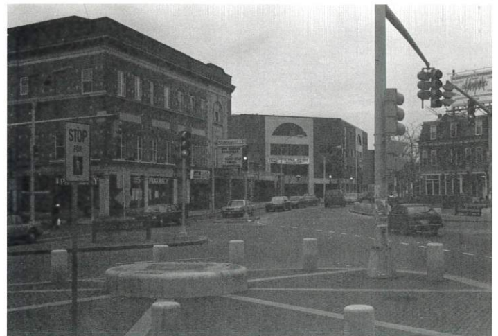
Davis Square, 1989. Looking west toward the Somerville Theatre.

48 Grove Street. This early twentieth-century industrial building situated along the former Lexington and Arlington Branch of the Boston and Maine Railroad was renovated as office space in 1986, and currently houses several architectural and design firms. Its former manufacturing tenants included a woodworking firm, a frozen food factory, and, most recently, a clothing manufacturer.