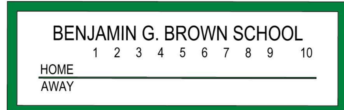
SCORE BOARD WALL GRAPHIC Scale: 1/2" = 1'-0"