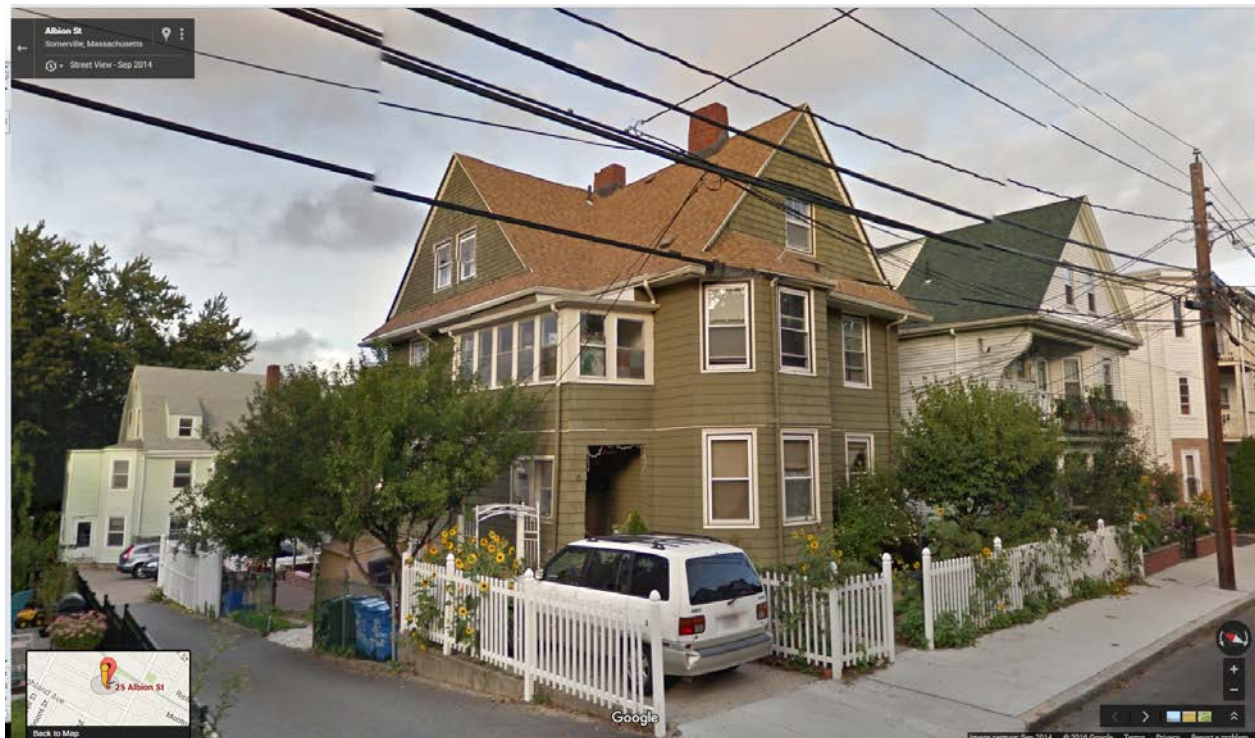
Street view of property