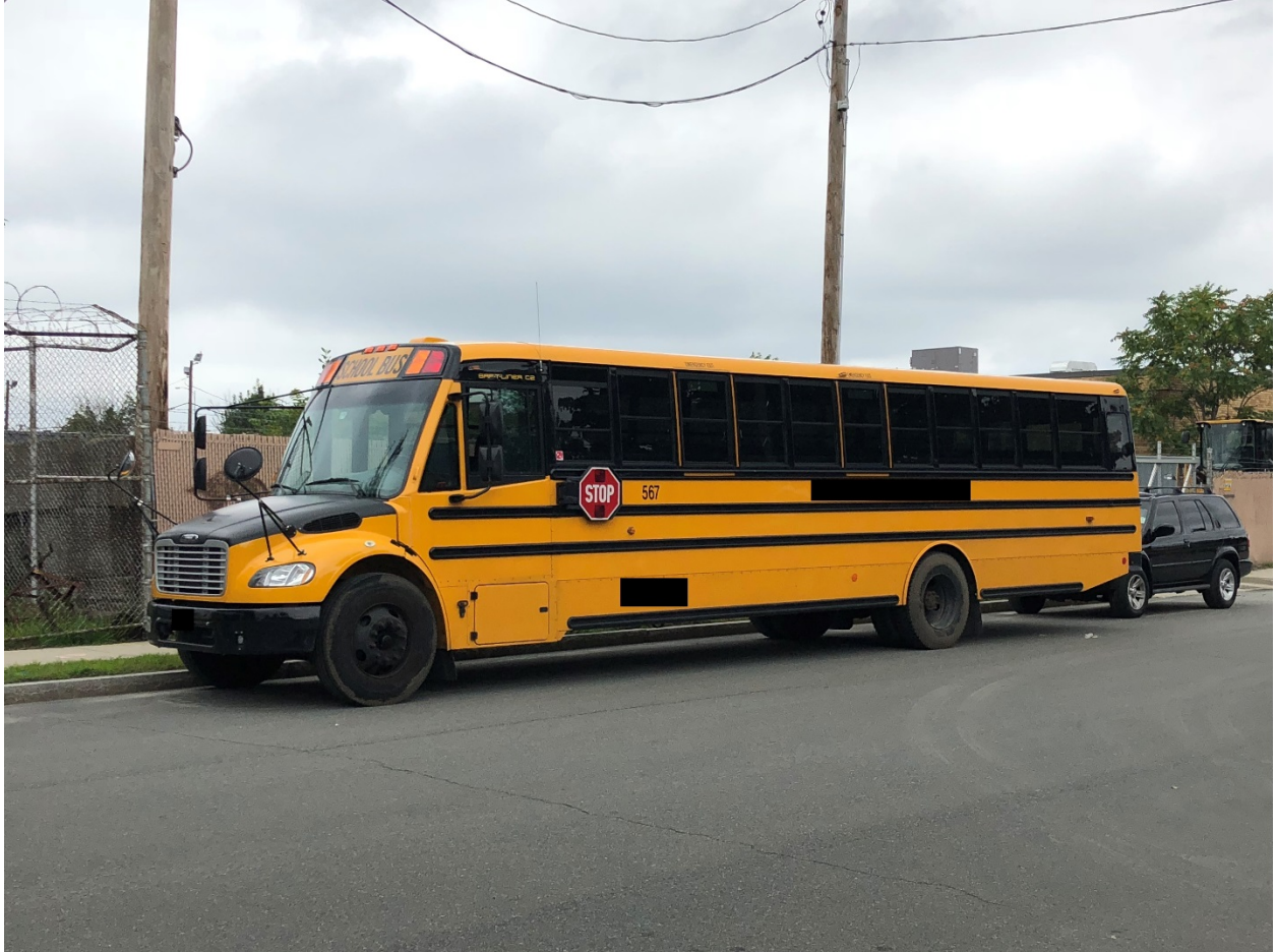
Figure 3: Bus Parked On-Street along Chestnut Street