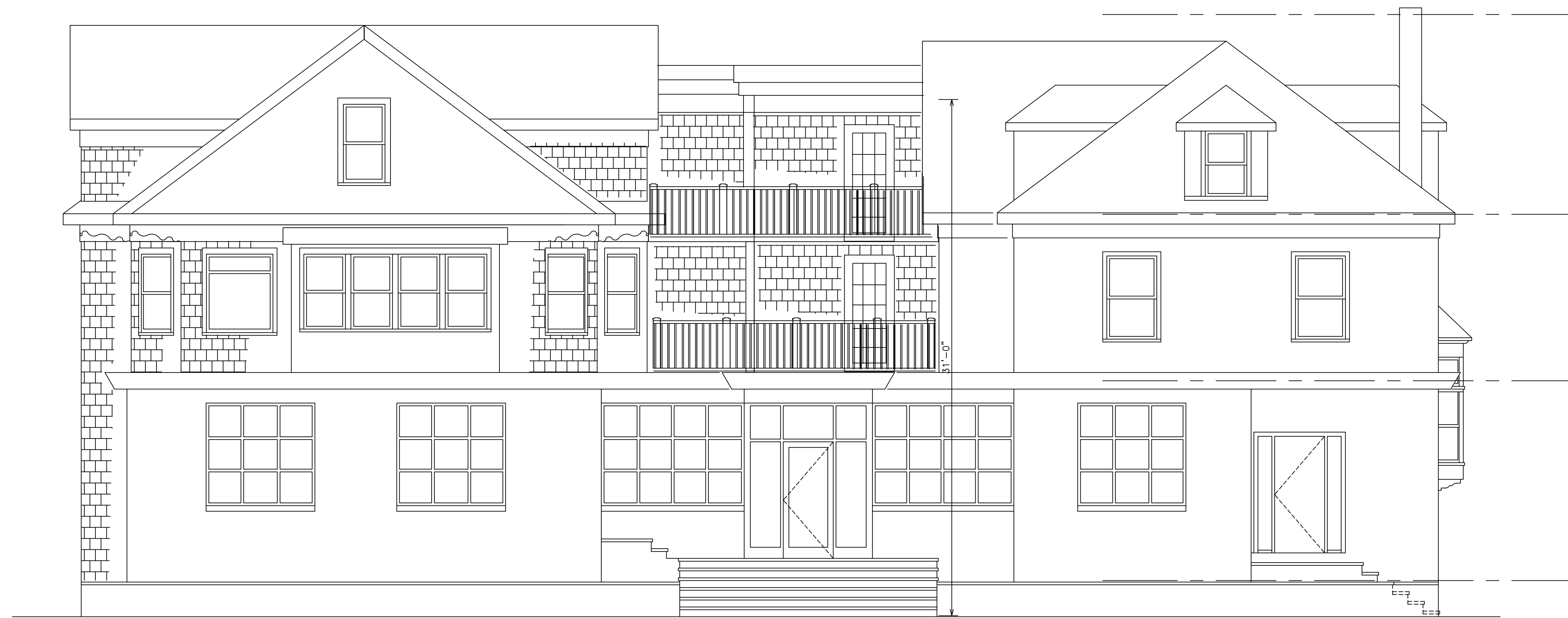
E FRONT ELEVATION DD 1 \frac{1}{8}'' = 1' - 0''