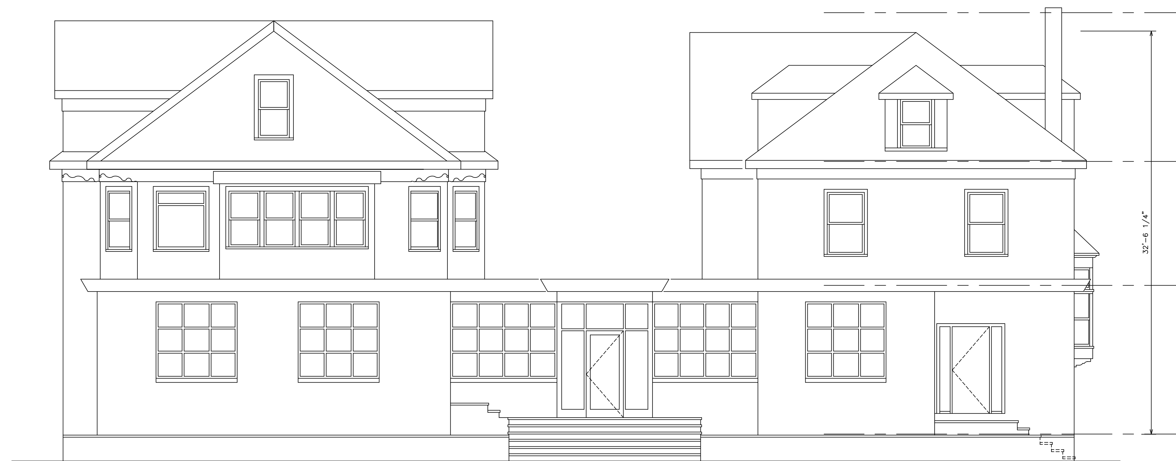
E FRONT ELEVATION DD 1 \frac{1}{8}'' = 1' - 0''