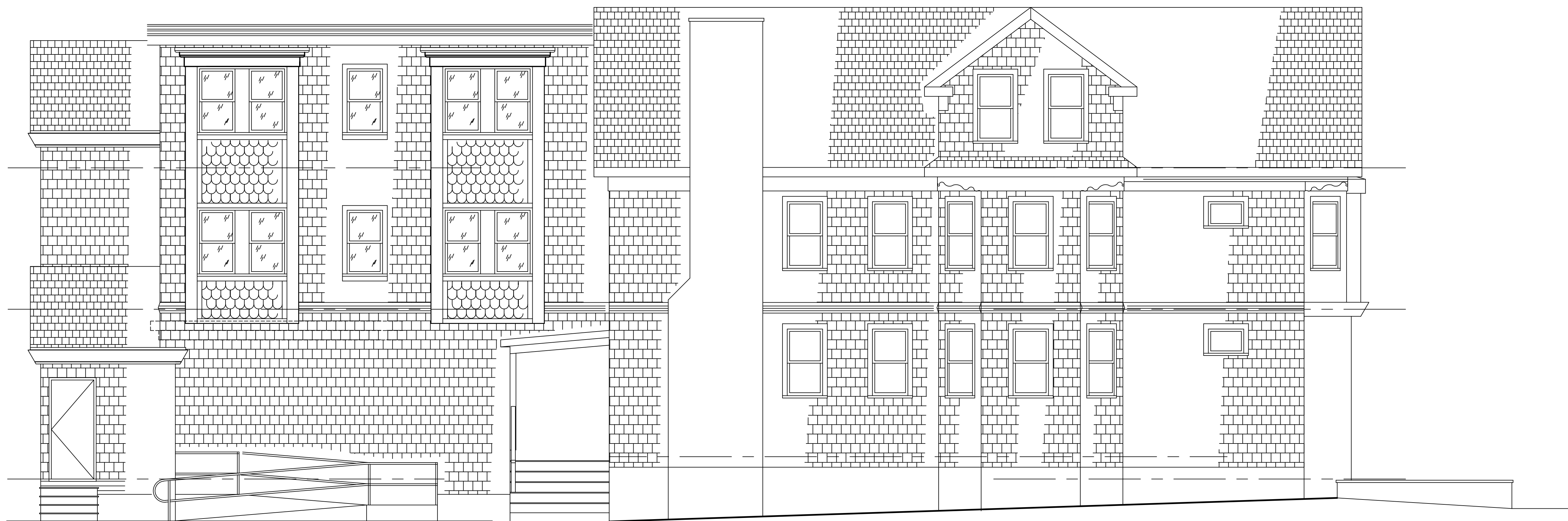
C LEFT SIDE ELEVATION DD 2 \frac{1}{8}'' = 1' - 0''