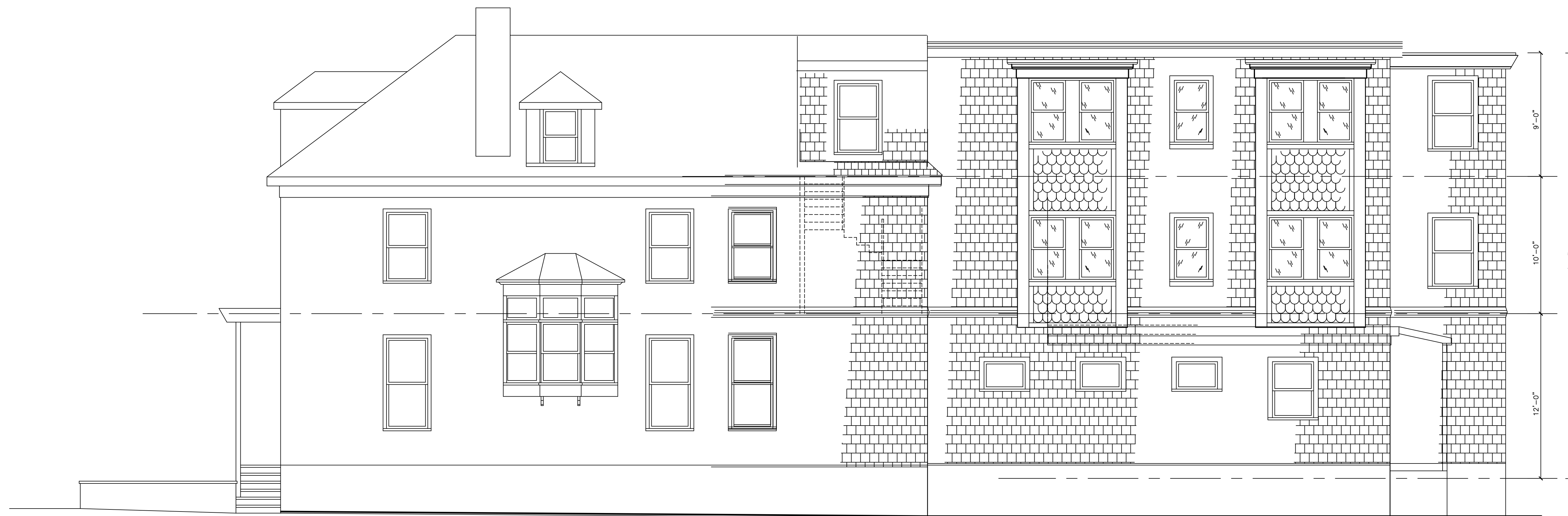
E RIGHT SIDE ELEVATION DD 1 \frac{1}{8}'' = 1' - 0''