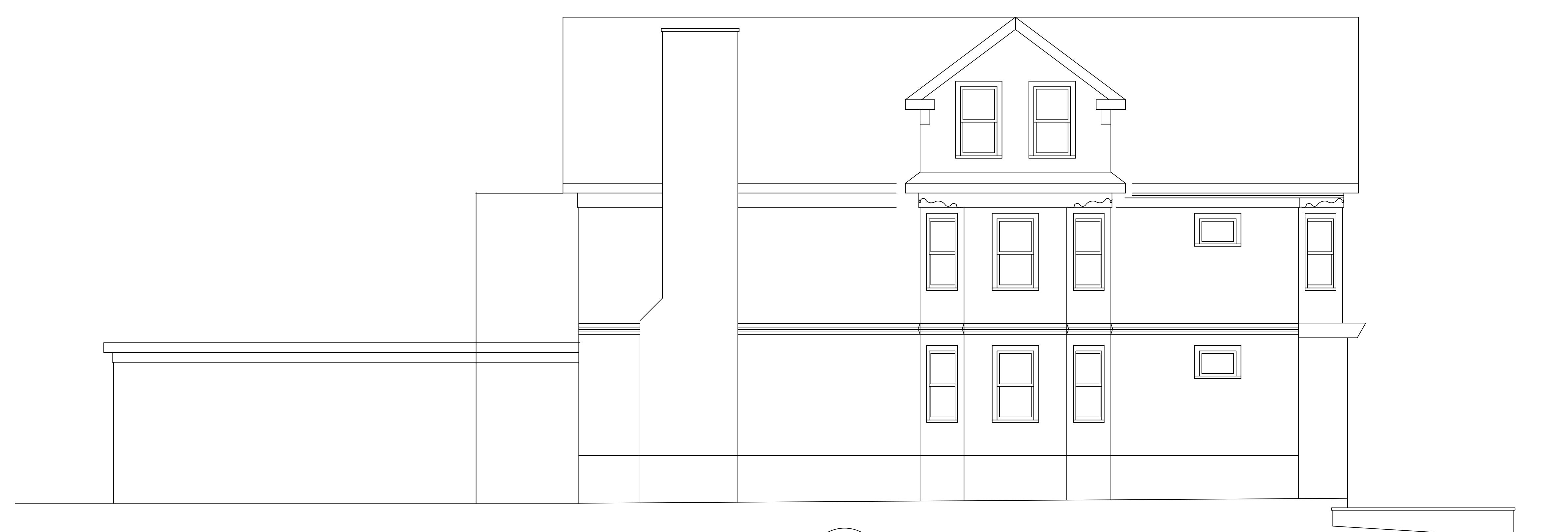
D LEFT SIDE ELEVATION DD 1 \frac{1}{8}'' = 1' - 0''