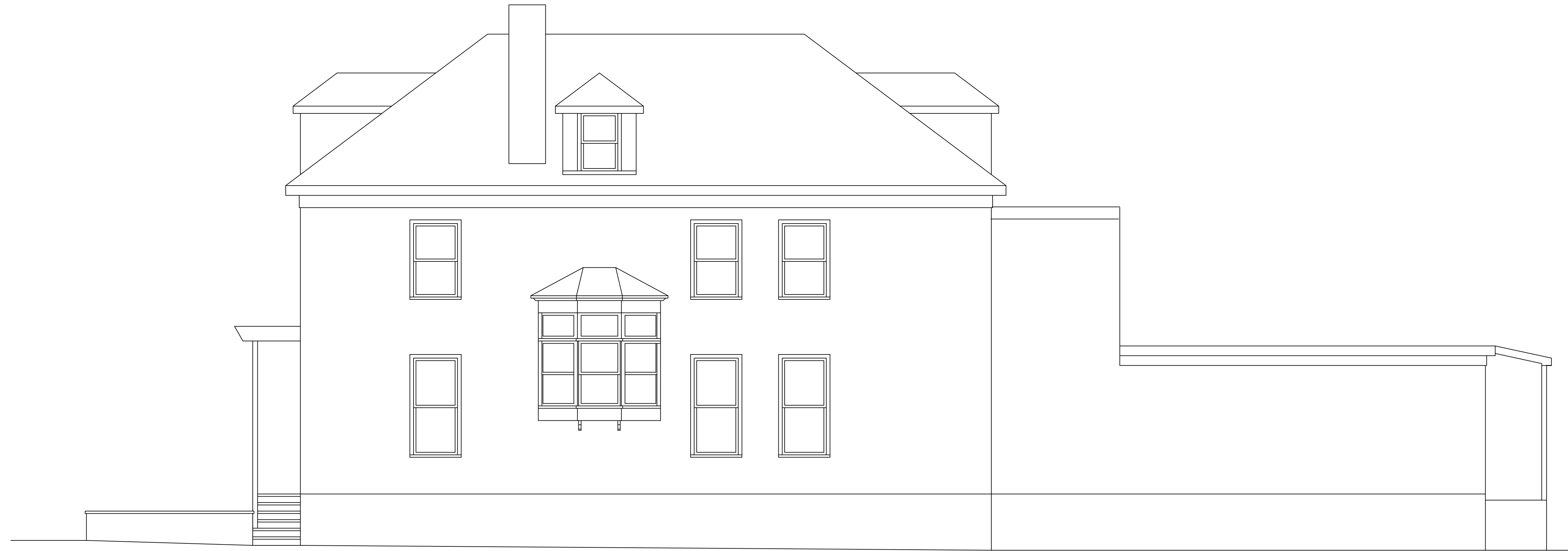
E RIGHT SIDE ELEVATION DD 1 \frac{1}{8}'' = 1' - 0''