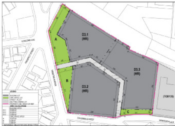
D3 Block and Lot Plan

The Public Process and Design Review Report section serves to catalogue and summarize the public entitlement process carried out to date. The section provides information on the date, time and location of meetings, a summary of information discussed, description of material shown, along with a summary of any changes made because of a specific meeting. The D3.1 Building along with the zoning required 'Plaza' type Civic Space have advanced through the sequence of public meetings together. Provided the direct planning relationships between the Building and the Civic Space, and the intent to deliver each improvement simultaneously, this report has been structured to include feedback on each application for reference. As the foundation for any proposed building or civic space project in the Union Square redevelopment area, the approved Coordinated Development Special Permit (CDSP) provides the point of departure for the proposed design's evolution. For reference the D3 block's CDSP-approved 'Block and Lot Plan' (below top) can be viewed relative to the subjects of this DSPR application below. (below bottom).