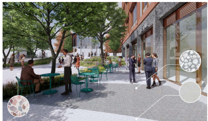
Civic Space Plaza Refinements Presented