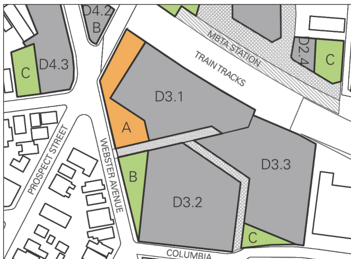
D3.1 DSPR Application