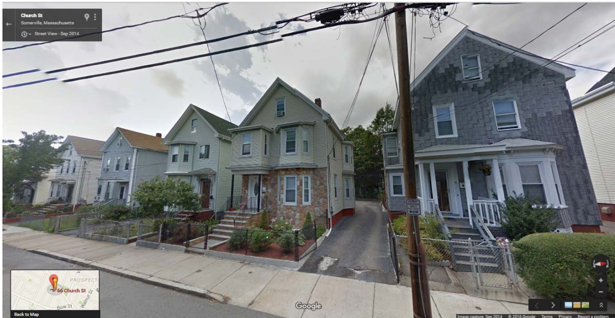
Street view of property (yellow with stone veneer)