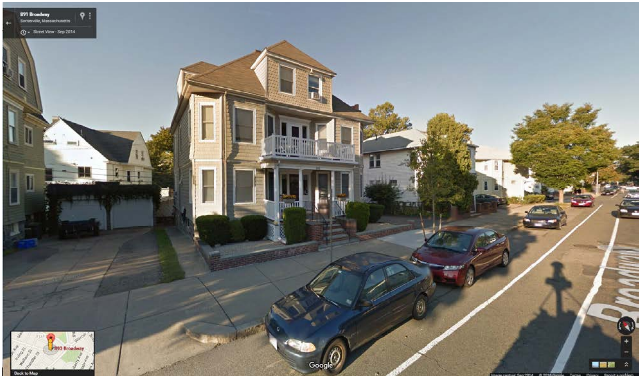
Street view of existing structure in context