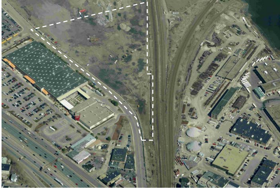
Approximate location of Block 11 – image from April 2009 – after buildings were razed