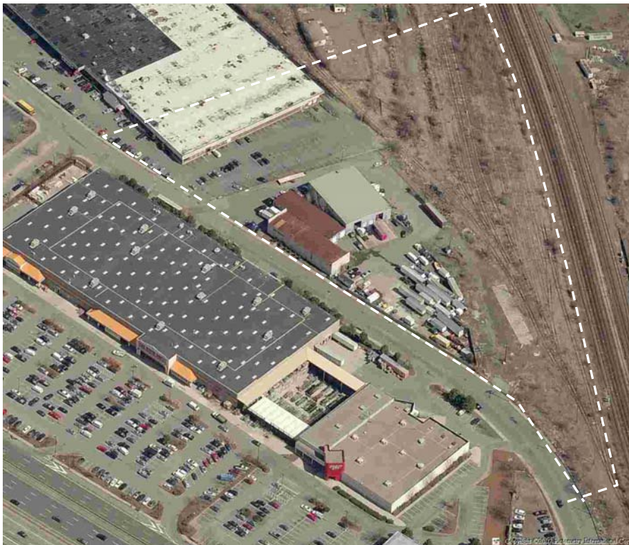
Approximate location of Block 11 – image from April 2008 – before buildings were razed

The area surrounding the proposed site contains Draw 7 Park on the opposite side of the MBTA Orange Line tracks, Home Depot and the vacant Circuit City building to the southeast and the development of the Assembly Row Blocks 1, 2, 3 and 4 are complete and nearing full occupancy. Blocks 5 and 6 are under construction. Assembly Square Drive, which is now Grand Union Boulevard, roadwork and landscaping that were part of the Phase IAA approval are complete. The subdivision of land that corresponds to the Blocks approved in the PUD is complete and was recorded on December 28, 2011.