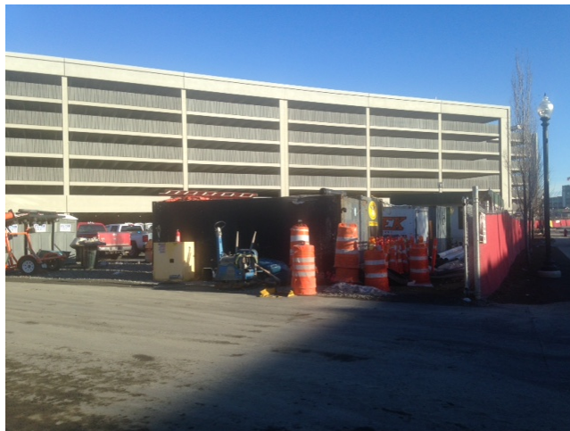
Location of proposed daycare and on-street parking – image from January 2016