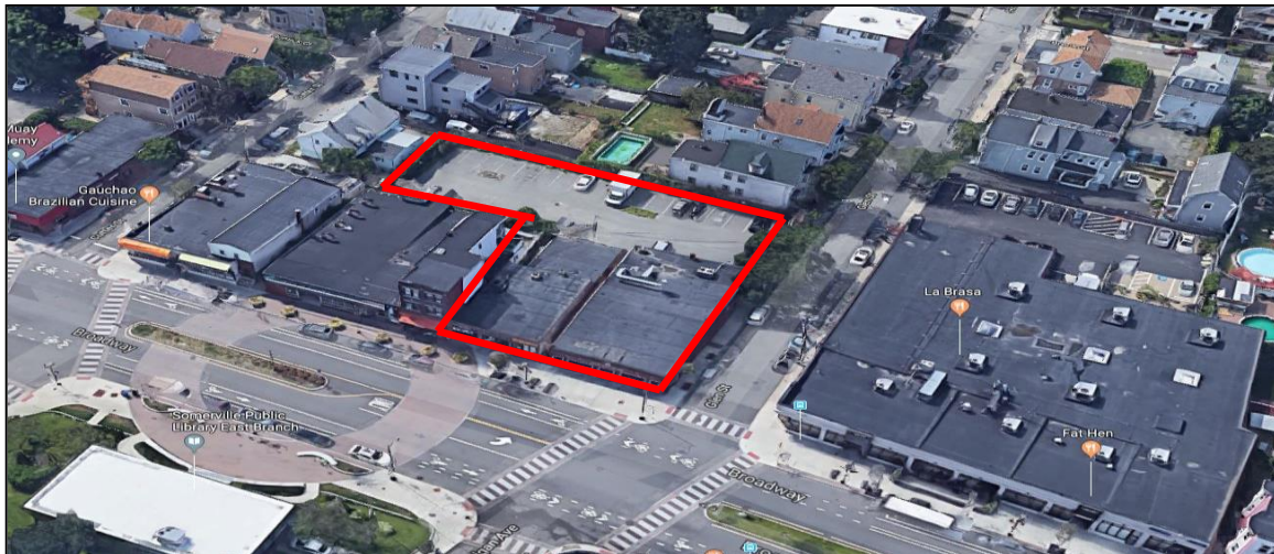
Top image: Street view of 114 Broadway and 118-120 Broadway Middle image: The 8 Glenn Street parking as seen from Glen Street, behind 118-120 Broadway Bottom image: Aerial view of the approximate project area.