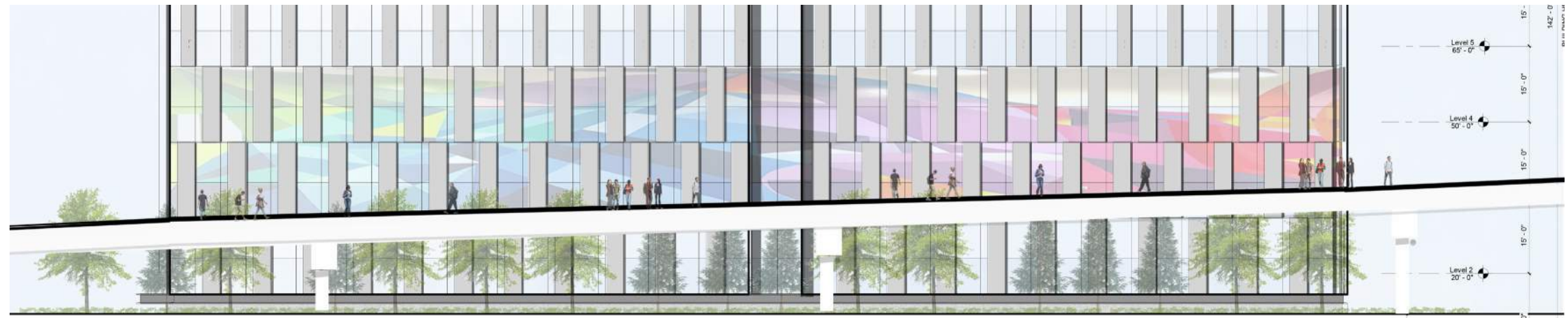
5 YEAR GROWTH