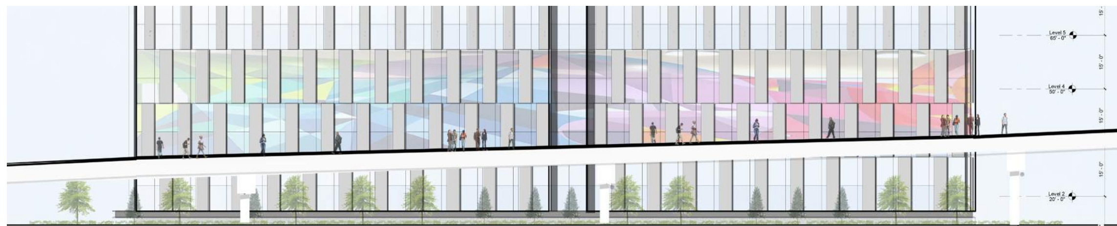
DAY 1 INSTALLATION