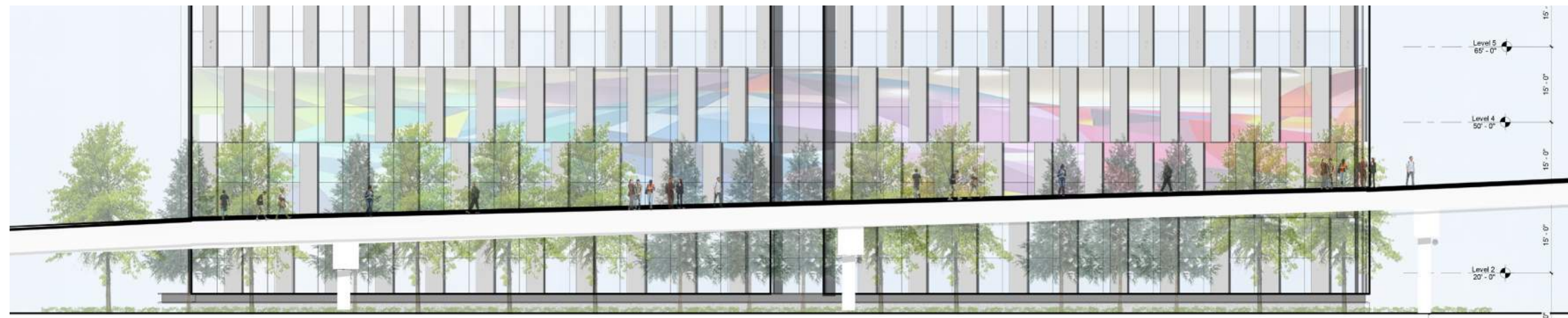
10 YEAR GROWTH