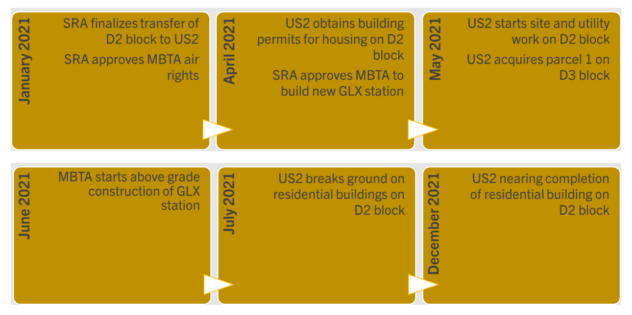
Figure 2: Union Square 2021 Redevelopment Milestones

Councilor Ben Ewen-Campen initiated community meetings about redevelopment of 600 Webster Street, which is the current site of Royal Hospitality, a major employer in the area.