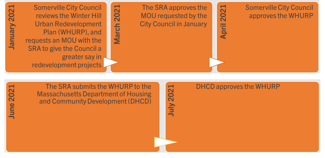
Figure 4: Winter Hill 2021 Redevelopment Milestones

Mark Development, a private developer, then moved to acquire privately held properties around 299 Broadway to build a mixed-use development with 190 dwellings, 14,000 square feet of retail space, and 3,000 square feet of civic space. By October, they had both the 299 Broadway site and the adjacent 15 Template Street site under agreement. Mark Development then began petitioning the City Council for a zoning change that would change the zoning designation of the site from MR3 to MR6, which would allow for a total of 280 or more units to be built on the site. These zoning changes were supported by the majority of attendees at several community meetings hosted during the year.