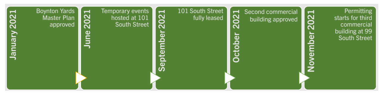
Figure 3: Boynton Yards 2021 Redevelopment Milestones

In 2021, the City approved this Master Plan, and the firm completed its first building at 101 South Street, where it hosted an Oktoberfest and other outdoor events on a temporary civic space. Later in the year, the City granted permits the second building in the Master Plan, and DLJ applied for permits to build the third structure. At full build out, this project will generate nearly thirty million dollars of community benefits to the City, along with seventy million dollars in infrastructure improvements.