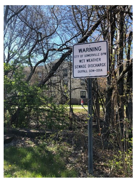
Figure 3 - SOM001A Sign

• Outfall signs – Somerville has previously installed signs at CSO outfalls. Photographs of these signs are included in Figure 3 and 4.