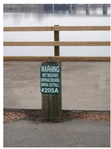
Figure 4 - MWR205A Sign