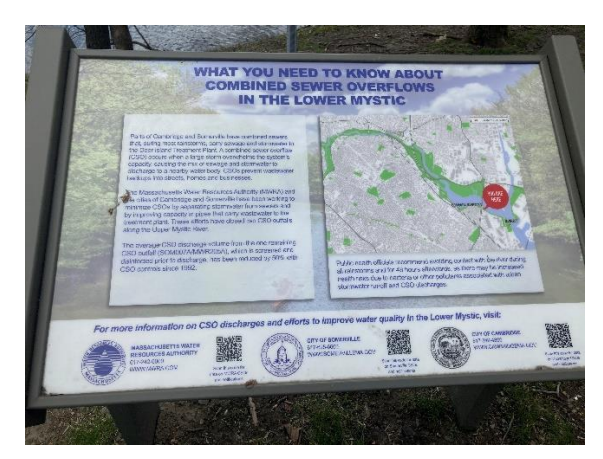
Figure 5 – SOM007A/MWR205A Permanent Sign

The existing sign at CSO outfall SOM007A/MWR205A, as shown in Figure 4, includes only the MMWRA CSO outfall number (205A). A permanent sign (see Figure 5) was installed in 2021 approximately 10 feet to the right of the existing warning sign. This permanent sign includes CSO educational information and identifies this CSO outfall by SOM007A/MWR205A.