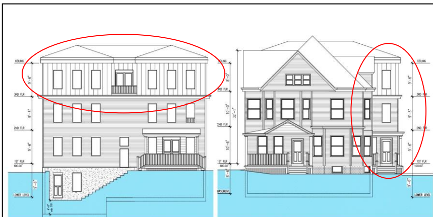
March 20, 2019 proposal