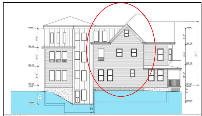
March 20, 2019 proposal