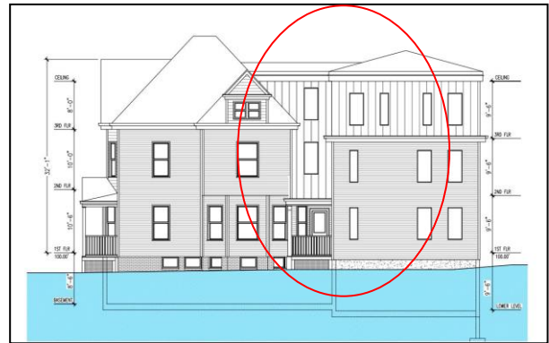
March 20, 2019 proposal