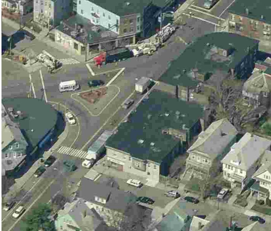
View of 1133 Broadway and abutters on Westminster Street

2. Proposal: The current proposal is to add 8 residential units to the two-story building, making it three stories. There will be 8 one-bedrooms, 4 two-bedrooms and 2 three-bedrooms The units will contain two bedrooms and a kitchen, living/dining room and a bathroom. The 3-bedroom units will be the affordable units. Also, one of these 3-bedroom units will be made accessible by converting the small office and a portion of the storage space on the ground floor will be converted to residential with a LULA to access the rest of the unit on the second floor. The accessible unit will have its own entrance directly off of the sidewalk.