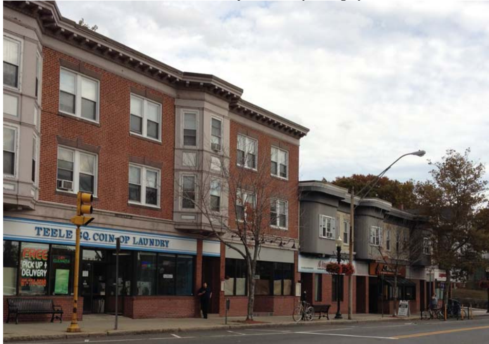
1119-1133 Broadway – view from Broadway

wall. One of the buildings has three-stories and the other has two-stories. Both have retail on the ground floor and the upper floors are residential. There are 16 residential units in the parcel at the corner of Broadway and Curtis Street and 8 units in the building on the subject property. The owner of these two properties also owns 8 Curtis Street, a parcel around the corner that is a parking lot and is also currently under review for a variance to construct a 2-1-family with 6 parking spaces.