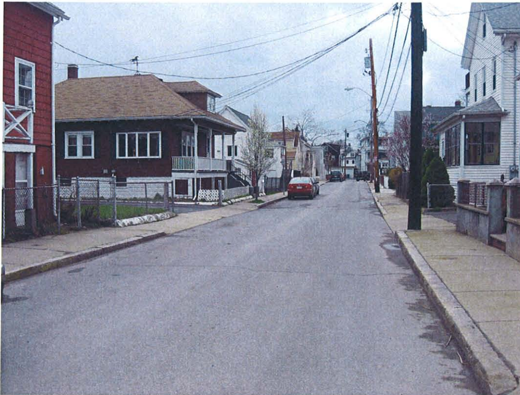
Clyde Street Looking West

Because on-street parking may be affected by the proposed development, DCI performed a parking availability survey of on-street parking along Clyde Street. The parking survey was conducted on a typical weekday (Thursday, March 29, 2012) and on a Saturday, March 31, 2012). There is parking for approximately 20 vehicles along the south side of Clyde Street from Warwick Street to Cedar Street. The parking survey data is shown on pages 4 and 5. As indicated in the recorded data, there was an average of 12 available parking spaces on Clyde Street from 12-1PM and 8 spaces on Clyde Street from 4-7PM on a typical weekday. There was an average of 8 available parking spaces on Clyde Street on a Saturday from 1-4PM. DCI noted that the parking availability experienced a downward trend on a Saturday afternoon and therefore expanded the survey. The expanded survey was conducted on Saturday morning April 21, 2012, which we believe is the critical parking period for a residential neighborhood. (weekend overnight).