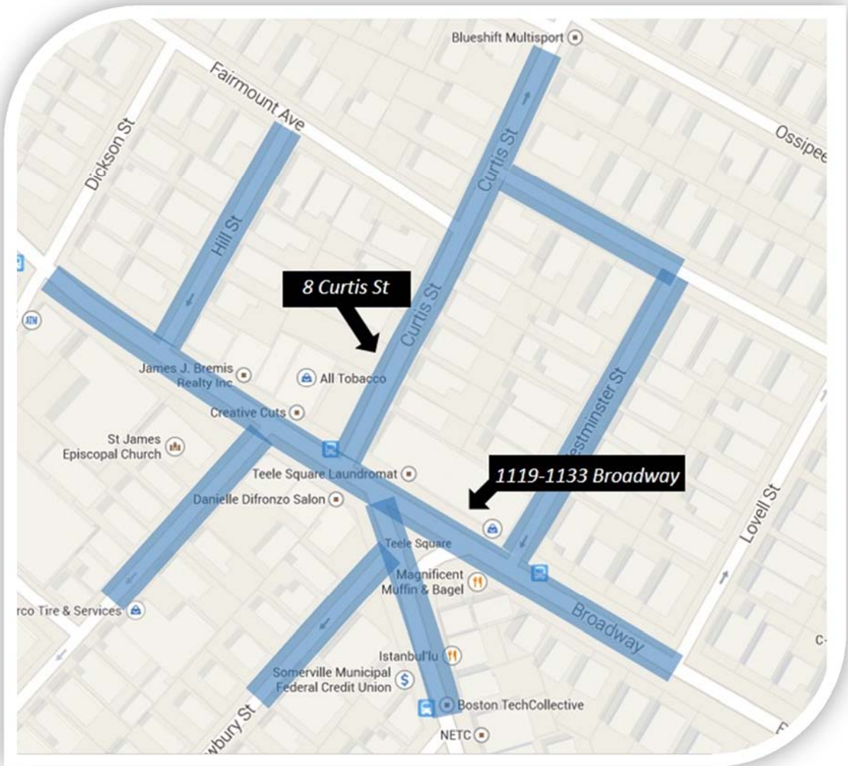
Figure 4: Project Study Area