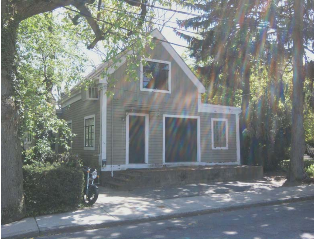
Existing Conditions: 92 Properzi Way