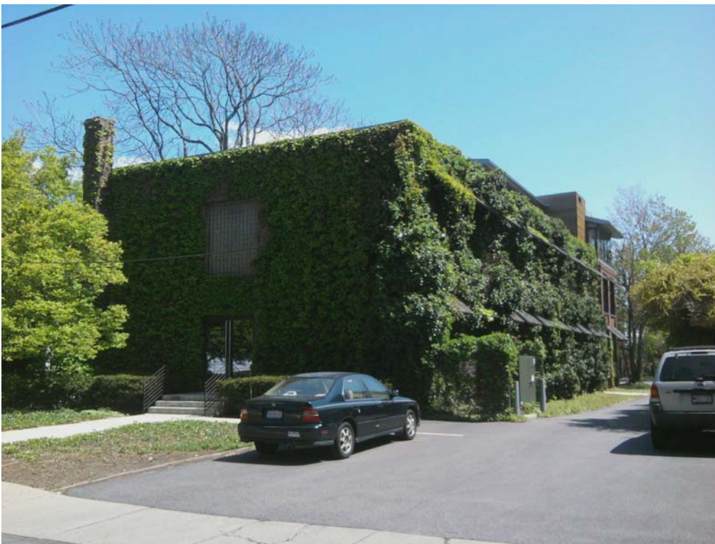
Existing Conditions: 100 Properzi Way