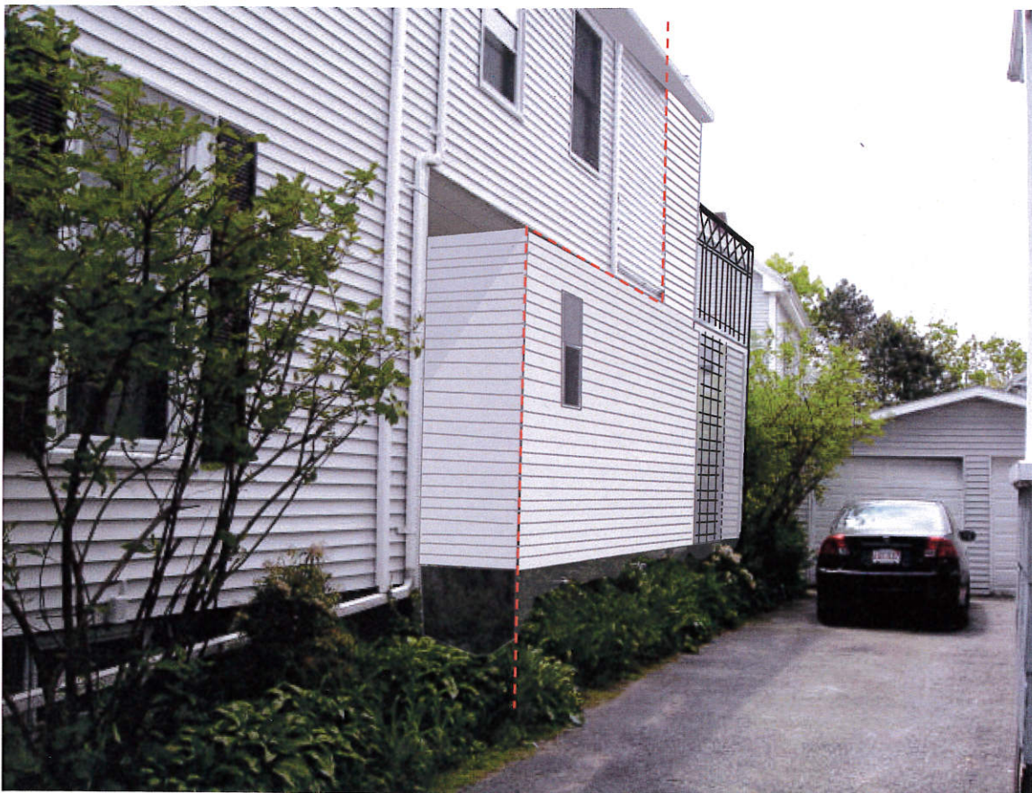
West elevation, with new infill and rear extension