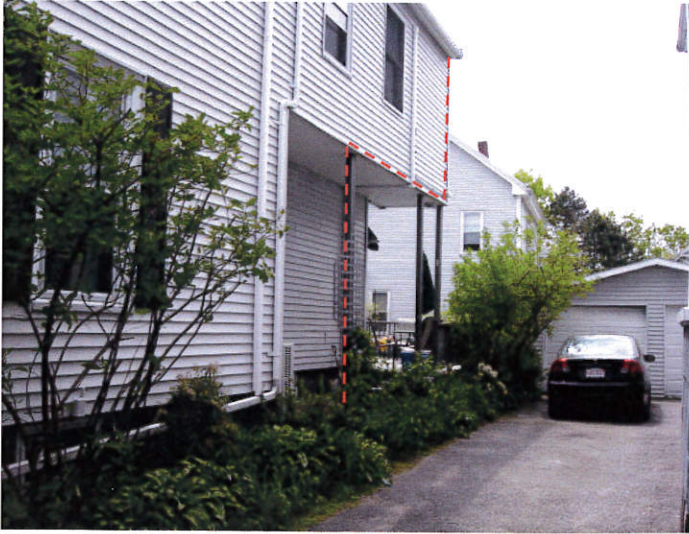
West elevation, existing