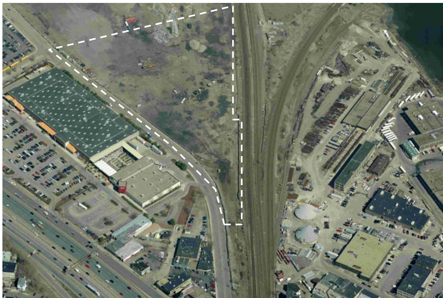
Approximate location of Block 11 – image from April 2009 – after buildings were razed