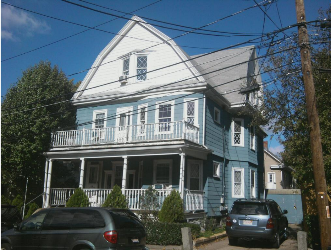
Existing Conditions: Picture of structure from the streetscape (top); Picture of the living space above the first floor rear porch (right).