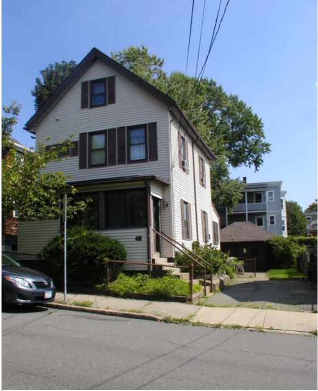
48 Newbury St – front and rear