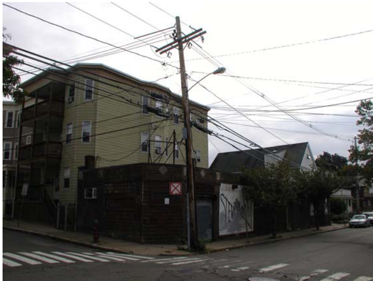
77-83 North Street: (l) existing structure, (r) sidewalk and street trees along subject property

The site will include landscaping and parking spaces. There will be four parking spaces located at the corner of North Street and Conwell Avenue. There will be a prefabricated black metal fence around the parking area. A new tree will be planted in the landscape area along Conwell Avenue. There will be a curb cut on North Street which will require moving a street tree in order to locate the curb cut in an effective location.