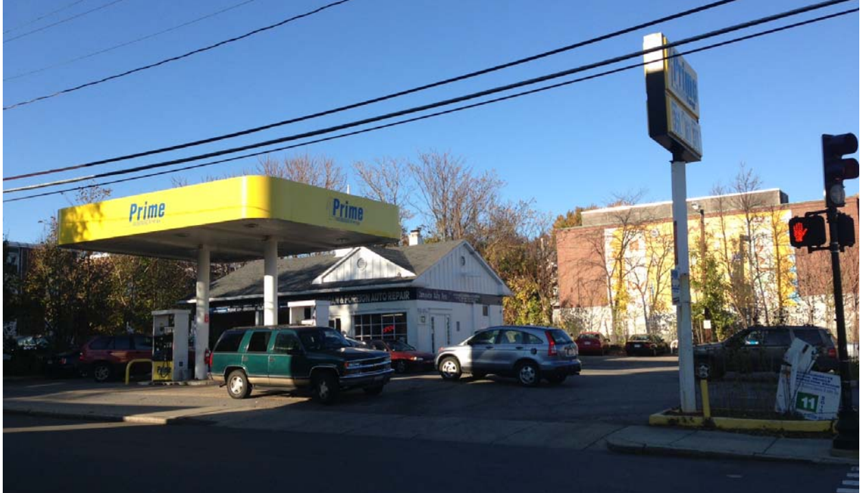
Existing Gas Station