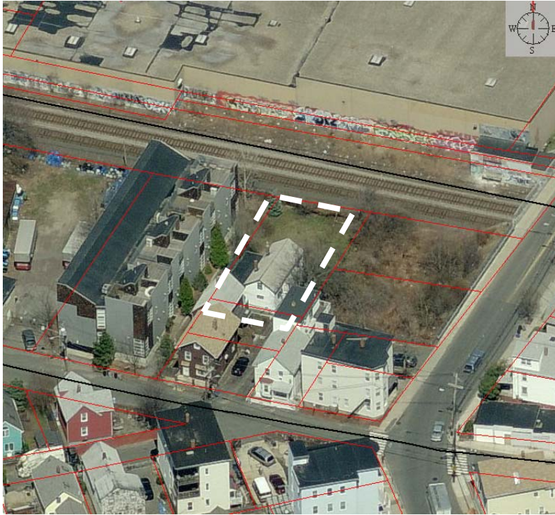
1 & 2 Village Terrace: (top) aerial view, (bottom) view of existing structures from Village Street

The buildings were placed closed together; there is six feet between 1 and 2 Village Terrace and less than two feet between 5-7 Village Street and 1 Village Terrace.